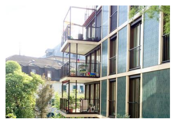
All 34 accommodation units boast either a balcony or a terrace.