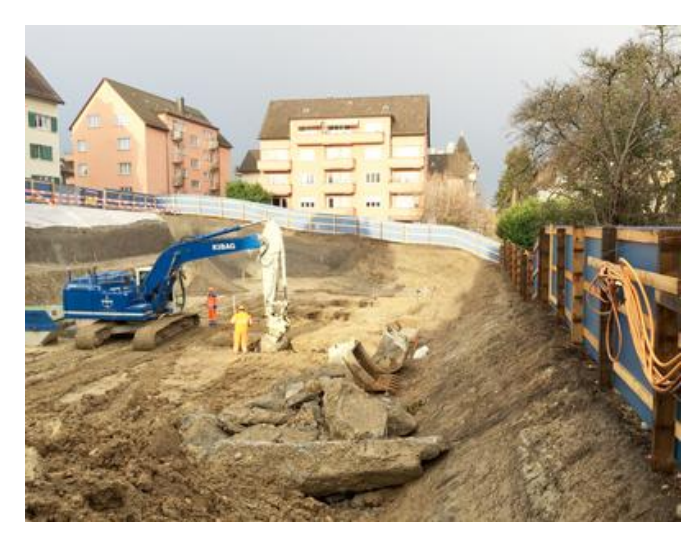
The construction pit following demolition of the largest New Apostolic Church in Switzerland.

In terms of the temporary construction pit system, the site used a soil nail wall on the uphill side, while the pit was sufficiently secured by a slope on the downhill side. No dewatering was required on the site due to the shallow nature of the pit and the lack of groundwater or seepage water.