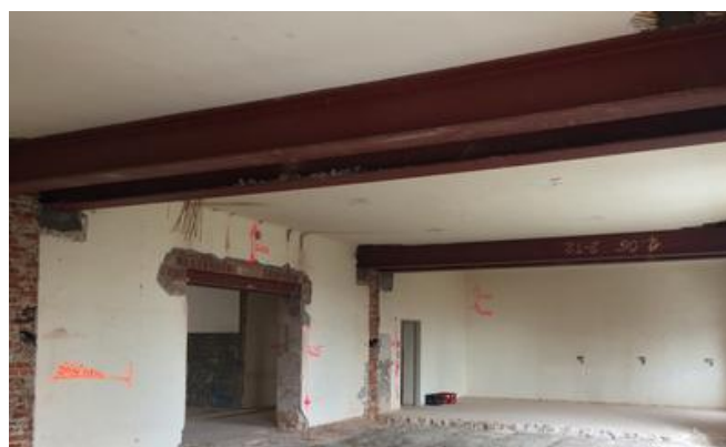
Internal supporting walls had to be removed from the large dining hall and the ceilings underpinned with steel beams.

An unpleasant surprise met the PORR workers when they exposed the old wooden ceilings: various damages meant compliance with the relevant norms was impossible. Additional timber had to be incorporated into all the ceilings. In addition, all the gaps in the original Traunstein marble facade had to be supplemented with original material, and the facade restored to its original condition; a clock on one of the gables also needed renovation, and in addition to the above-ground work, all the drainage systems and underground pipes in the cellar were brought up to date. All covered components were fitted with fresh seals and perimeter insulation. An old arch, exposed during the renovation work, is now a feature in the newly-built bistro. Internal supporting walls on the second floor had to be removed and the ceilings underpinned with steel beams before the large dining hall could be created as required. An external emergency stairwell was built on the north side, as specified by the authorities.