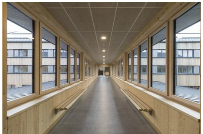
The new Forestry Training Centre.

The training campus has been in full-time operation since September 2018. The ambitious deadline was only met thanks to great cooperation between all the teams on the construction site and the different subsections.