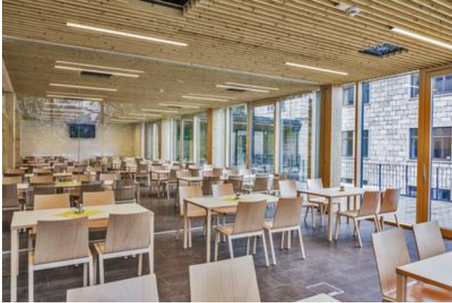
Timber is the main construction material used in the canteen.