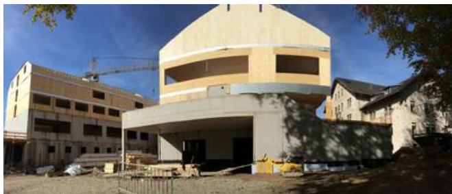
Two weeks later: work begins on the roof truss.

PORR supplied all the necessary new presentation documents, certificates, timber structural designs, fire-resistance checks, etc. and obtained the new building permit needed for the timber construction. Additional permission was also obtained to create a 100m firing tunnel for long guns, which had not been included in the initial application. Another change agreed with the building authorities was the partial extension of the attic floor in the residential block.