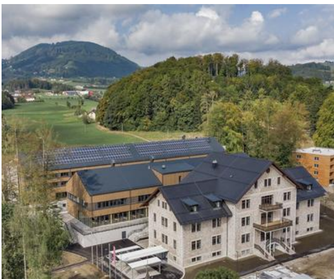
The original building is in the foreground; behind it can be seen the new timber buildings with solar panels on the roof.

The innovative and thermally high-quality building envelope, coupled with state-of-the-art efficient building technology and the 123 kWp solar system, represents an important foundation element for the klimaaktiv “Gold” certificate. PDE supported this aspect of the project from the initial contract award through to the inauguration of the Centre. Initiatives such as building project management and optimisation of the energy technology across the entire project meant that PORR could act as a “one-stop shop” to meet all the customer’s requirements. The subsequent quality assurance was carried out via various measurements, e.g. airtightness in the spaces, quality of the air inside and sound insulation. Great collaboration between the construction site and PDE ensured that the klimaaktiv Gold Standard was achieved without significant additional effort for the contractor or extra costs for the client.