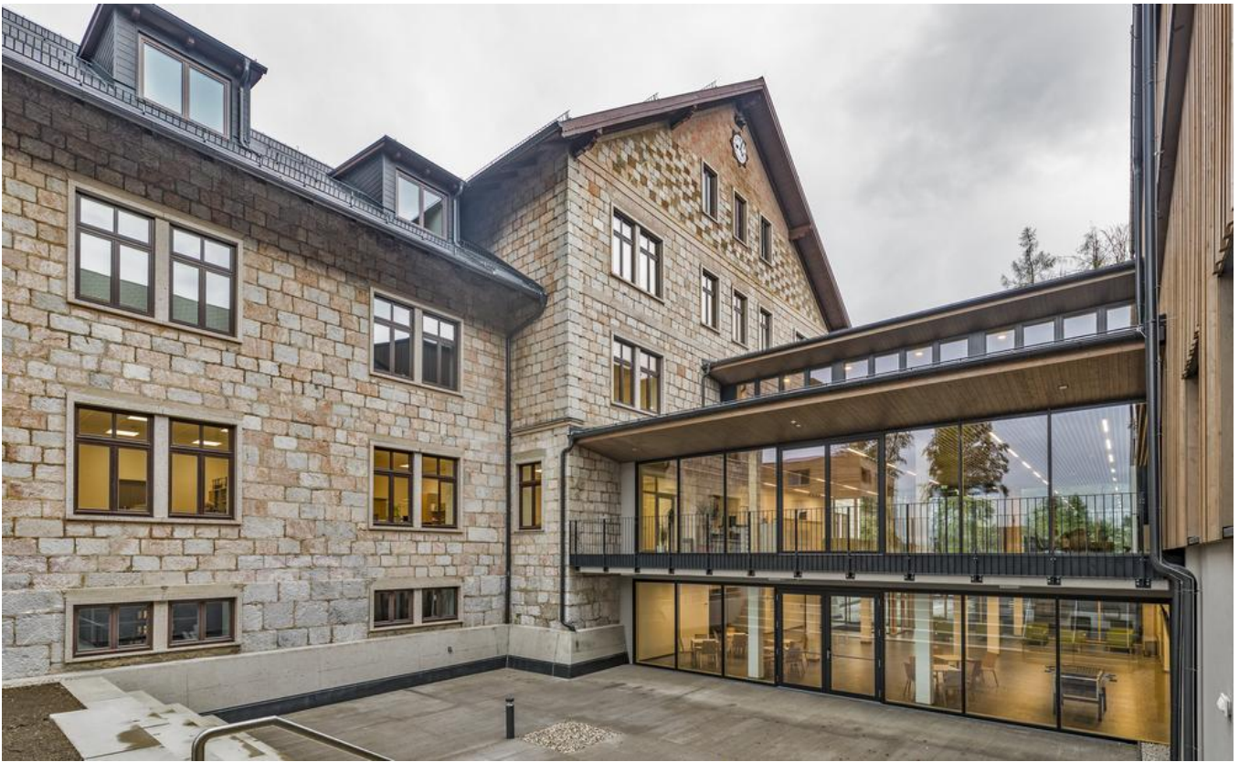
Glazed walkways link the heritage-listed hunting lodge to the newly-built school and residential buildings.

In addition to the short construction period (15 months), a particular challenge was posed by the contractual requirement to certify the campus according to the klimaaktiv Gold Standard. klimaaktiv, which focuses on energy efficiency, climate protection and resource efficiency, is Austria's best known evaluation system for building sustainability: it guarantees compliance with the highest standards. All monitoring, acceptance and testing procedures were carried out by PORR Design & Engineering (PDE); IAT GmbH, another PORR subsidiary, took responsibility for the sealing and sheet-metal work. Installation of the 100m firing lane and all work on the outdoor facilities were carried out by PORR's Civil Engineering department.