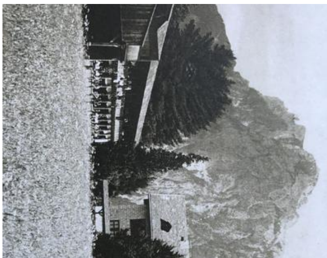
The former hunting lodge was the home of the Buchberg state hospital from 1921 to 2009.

The former hunting lodge has been adapted to a number of uses over the years. Back in the 1920s, for example, the villa was sold by the owners to the State of Upper Austria, and transformed into a lung sanatorium. Between 1973 and its closure in 2009, the building served as a special hospital for non-specific respiratory tract complaints. To prepare the heritage-listed building for its new role as an administrative building, a complete overhaul and conversion was – once again – necessary. During this process, the client attached particular importance to preserving the old structures. PORR removed the old asbestos fibre-cement tiles from the roof and replaced them with a new non-toxic double roof covering. The existing roof trusses had to be professionally overhauled, and all the original hand-cut rafters and purlins retained. Preservation of historical monuments also dictated that the windows should be replaced with wooden windows modelled on the originals.