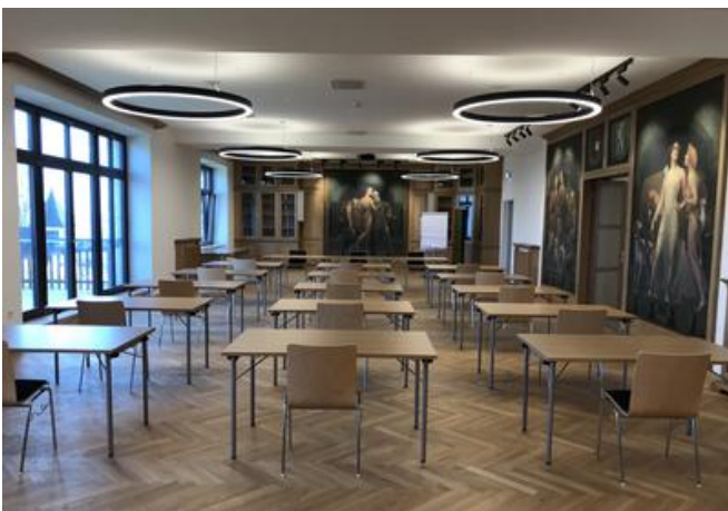
Tradition meets modernity in the dining hall located in the converted hunting lodge, now an administration building.

One interesting feature of the contract was the contractually-agreed requirement to obtain the final building permit. Why was this necessary? The two new buildings and connecting walkway were originally planned as reinforced concrete; these plans had been submitted and a valid permit obtained. However, the property subsequently changed owners, and the new owner, non-profit organisation Zuwo Zufrieden Wohnen GmbH, was keen to use timber structures for parts of the buildings - rendering the original building permit invalid.