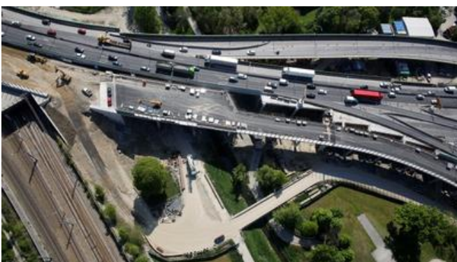
Several bridges were completely or partially rebuilt and an existing tunnel was backfilled.

After demolition of the northern lanes, several bridges were partially or completely rebuilt and a new overpass was erected. Once the structures just above it had been demolished and the new lanes constructed, an existing railway tunnel was backfilled with a mixture of conventional filling material and foam glass ballast to save weight.