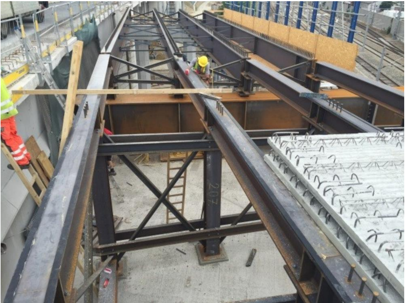
To create space for the construction site facilities and maintain ongoing traffic, the lanes were temporarily widened with the aid of composite steel bridges.