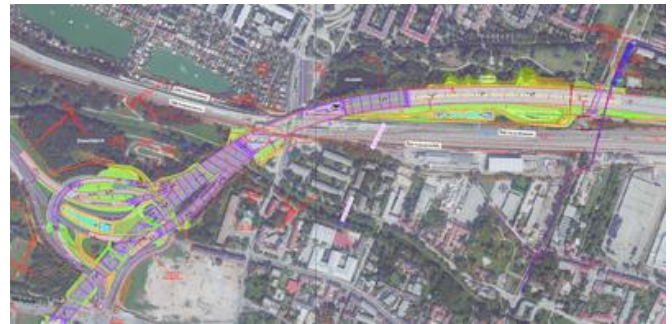
The Inzersdorf elevated highway on the south-east Vienna ring road is one of the busiest traffic intersections in Austria.

There was also a strong focus on minimising the impact on local residents. The employer Asfinag spent a total of 1.1 million euros on this. All the construction site roadways were paved and regularly swept and sprayed with water in an effort to reduce the amount of dust generated. The site setup area was scaled down, which meant that fewer trees had to be felled than originally authorised. Temporary noise protection walls were used while the existing noise protection walls were being dismantled, and speeds on the construction site were reduced to 60km/h and monitored by Section Control. Finally, working hours were cut to 6:00 a.m. to 8:00 p.m. from Mondays to Saturdays, although non-stop operations on the construction would have been legally permissible.