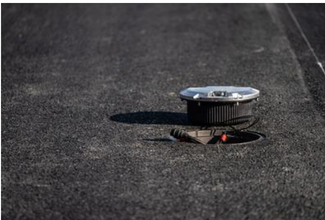
PORR replaced all beaming lamps on the runway.

The visual aids system for navigation was designed and executed to comply with all regulations for a category III Precision Approach Runway in both directions. The team replaced all the primary and secondary circuits mounted in protection pipes, the aeronautical beacons for the runway threshold, end, centre and touchdown area, the approach system, the stop bar along with all signs and markings. In addition, the tower remote control has been upgraded.