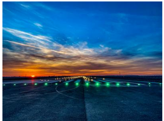
The newly installed beacons illuminate the finished runway.

The tight schedule and the resulting need for overlapping activities put the team to the test. The modernisation works of the runway were planned to be completed in eight months, but PORR successfully finished an extended scope of works in only five months. The runway could be reopened to air traffic on 19 February 2021.