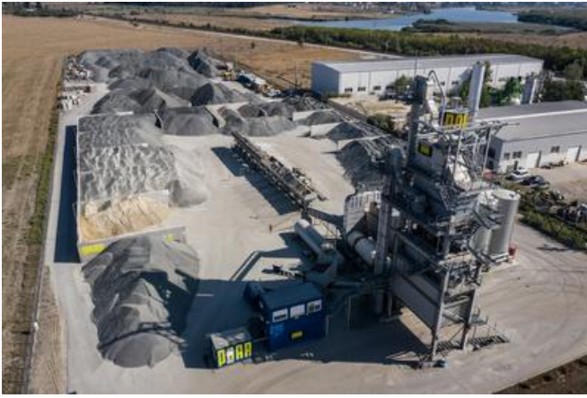
PORR's in-house asphalt plant in Bucharest produced most of the asphalt needed for the runway project.