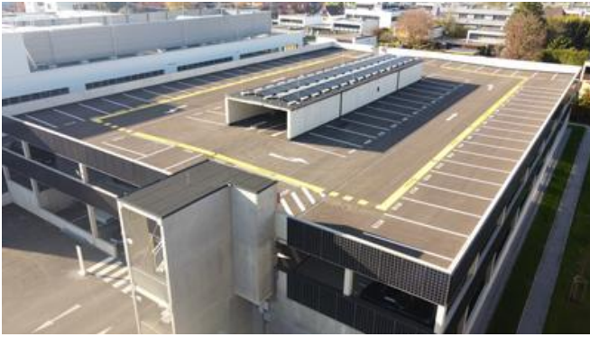
With a multi-storey car park on three levels and an expansion of the existing underground garage, the BMW site in Salzburg now offers more than 470 parking spaces.