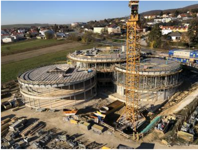
The floor plans of the three buildings are formed by intersecting circles. Spacious atriums are located at the respective centres of the circles.

fitting out the interior. The floor-to-ceiling, panoramic wood and aluminium windows were installed during the winter months, the drywalls were produced, the rails for suspending acoustic baffles from the ceiling were mounted, and the ceiling was sprayed.